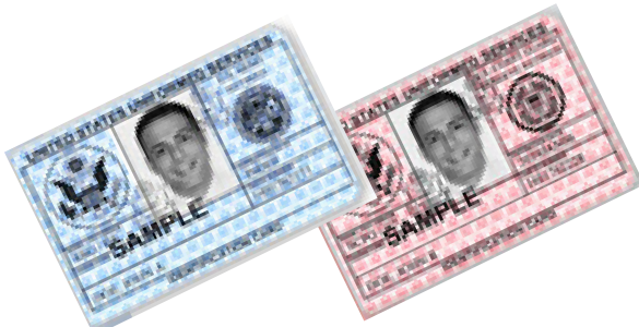
Military Retiree ID Card (if applicable)