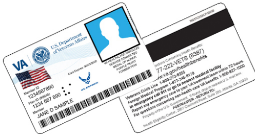
Veterans ID Card from the Veterans Administration (VA)