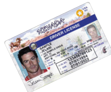
Valid Nevada ID