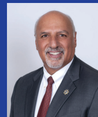
Stavros Anthony Las Vegas Mayor Pro Tem