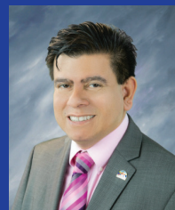
Issac Barron North Las Vegas Councilman