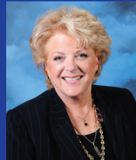
Mayor Carolyn Goodman Mayor of Las Vegas