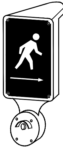
PEDESTRIAN PUSHBUTTON FOR 2 1/2" POSTTOP MOUNTING